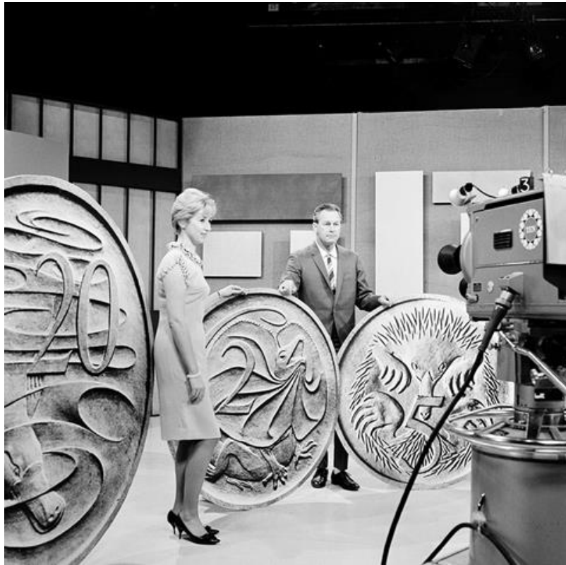
Pic: Training for the new decimal currency - a display of giant coins at the Channel 10 studio in Sydney 1965. By W Brindle. Courtesy: National Archives of Australia (A1200, L52590) http://dictionaryofsydney.org/image/94409