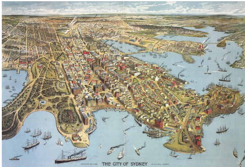
Pic: The City of Sydney (a birdseye view), 1888 by MS Hill Courtesy: City of Sydney Archives / Historical Atlas of Sydney http://dictionaryofsydney.org/image/97526